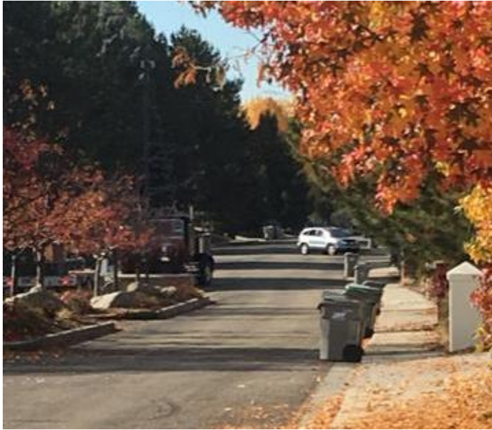
Photo 1: E. Braemere Diverter looking South – Construction traffic going the wrong way & car changing paths to avoid wrong way traffic (Date: Oct 27, 2017).